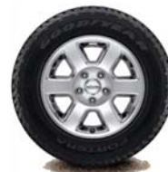
17-inch Platinum-Clad Forged Aluminum | Standard