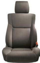
Telluride Cloth/Albi Cloth Medium Khaki | Standard