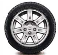
18-inch Casino Platinum-Clad Forged Aluminum | Available (late availability)

For more information, please visit jeep.com/commander