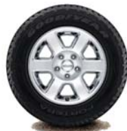
17-inch Chrome-Clad Forged Aluminum | Available