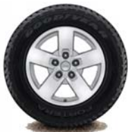
17-inch Wrench Cast-Aluminum with Machined Face and Sparkle Silver Accents | Standard Commander Sport and Commander Limited