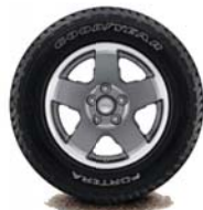
17-inch Hulk Cast-Aluminum painted Mineral Gray | Available