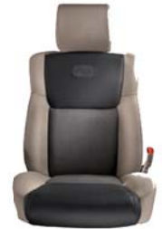
Yuma Leather Trim w/Preferred Suede® Microfiber Inserts Light Graystone/ Dark Khaki | Standard