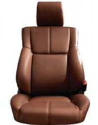
Yuma Leather Trim w/Axis Perforated Inserts Saddle Brown | Available